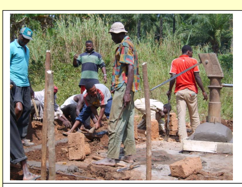
Repairs to an existing well