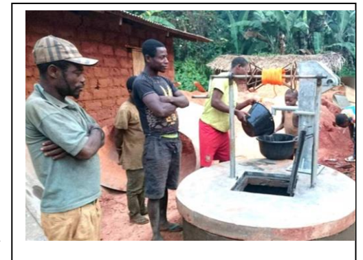
The new Well

The women normally give birth on the floor of their hut. For the most part they are a cashless society going to the forest each day searching for fruit and hunting bush meat. They standard practice for any WfC Well instillation is to include appropriate health care / training with the community. The health challenges within this community are immense.