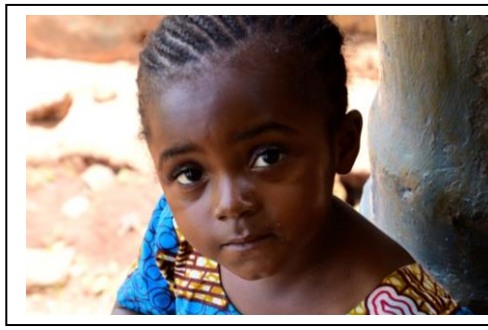
One of the many children

Not only are these displaced people suffering but the families who try to help them are also suffering. The displaced people who come to this part of Bamenda are thankful to Rotary club of Guelph Canada and others who provide support for a nice hot meal for them at the clinic each Sunday.